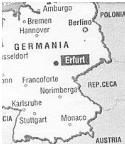
Erfurt is a town in East Germany, full of culture and traditions, which has been well known so far just for being the place where Martin Luther had studied theology.

26 April 2002: a 19-year-old boy, a pump-gun in his hands, enters Erfurt Gutenberg High School. He knocks on a door, goes into the room and shoots. He knocks on another door, and over and over again. Fourteen of his teachers, two young students and a policeman die. Then the guy commits suicide.