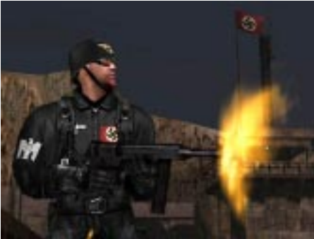
The computergame „Return to Castle Wolfenstein“

The tragedy of Erfurt cost 17 people their lives. Politicians and psychologists search for the reason of such a horrible happening. Some of them may have found the reason for that: violent films and brutal video games. Many politicians want to forbid these things. But the attempt is maybe in danger, because it is possible, that this is censorship (which is forbidden by the law). Otherwise there is another law, which says, that youth-endangering things are to be prohibited. So, these laws are strongly discussed, while computer-