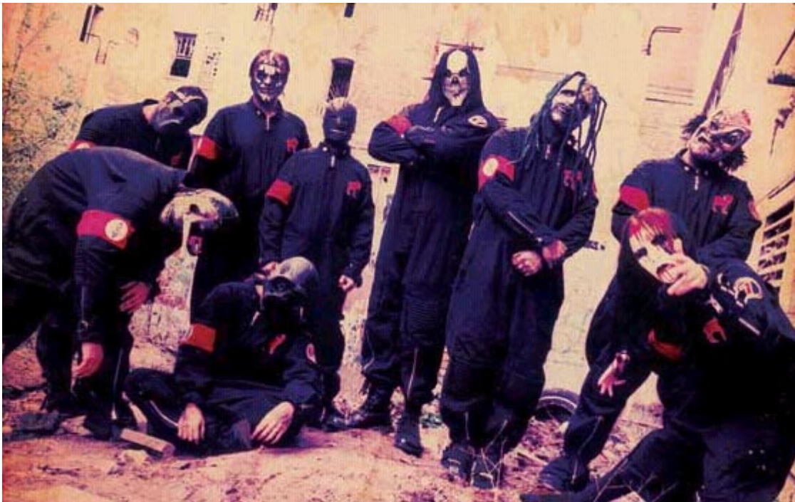
The Band „Slipknot“

People = Shit, People = Shit(12x), People = Shit(Whatcha gonna do), People = Shit( Because I'm not afraid), People = Shit( I'm everything you'll never be) People = Shit!