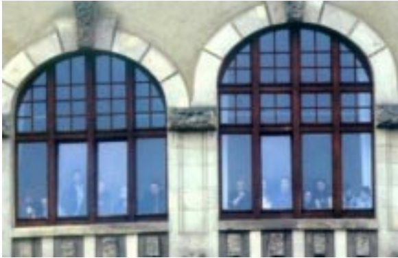
Fear at Gutenberg High School: people gathered in horror in the hall