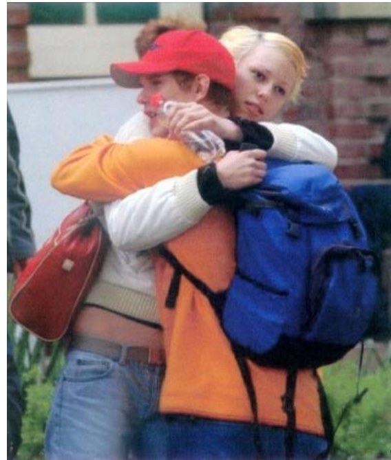
Two students trying to comfort each other after the tragedy

26 April 2002: a 19-year-old boy, a pump-gun in his hands, enters Erfurt Gutenberg High School. He knocks on a door, goes into the room and shoots. He knocks on another door, and over and over again. Fourteen of his teachers, two young students and a policeman die. Then the guy commits suicide.