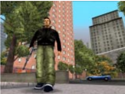
The computergame „GTA 3“

Another example is GTA 3. In this game you are a small gangster, who works in a huge fictive